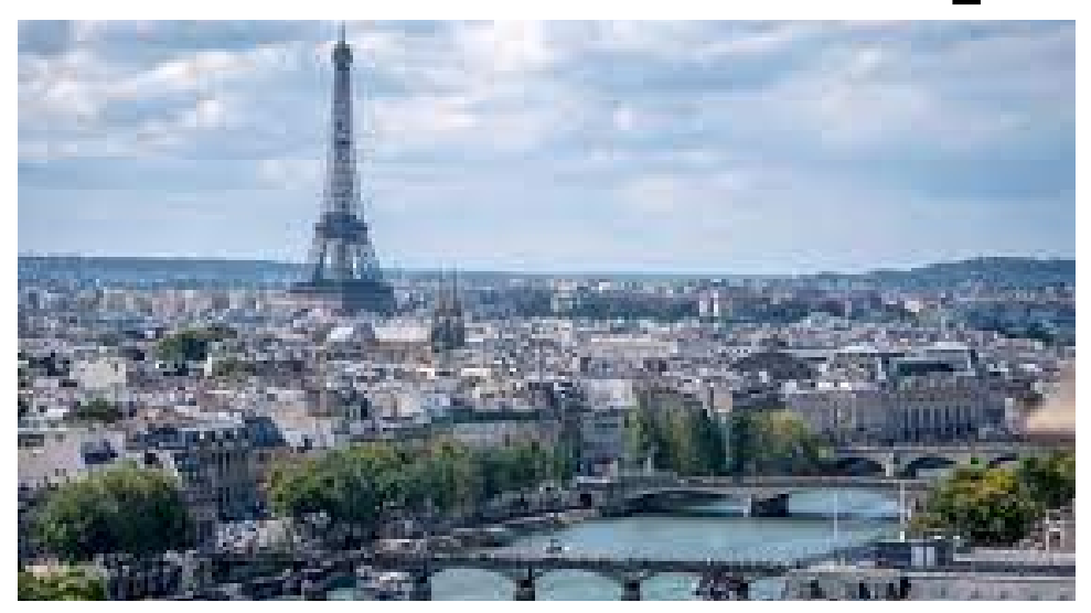
France - Paris

Spend 3 days and 2 nights exploring Paris; expeirenceing the infamous landmarks and exquisit cusine The French are well known for. For years 10 & 11 in January of 2023 and 2025. This trip also includes a day in Disneyland Paris as well as sightseeing and practising your grasp of the French language. Costs approximately £450 to include transport, accommodation and food.