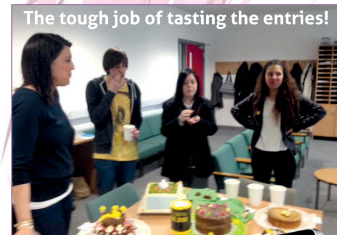
The tough job of tasting the entries!

Keep up to date with all that is going on a Ormiston Venture Academy at: www.ormistonventureacademy.co.uk