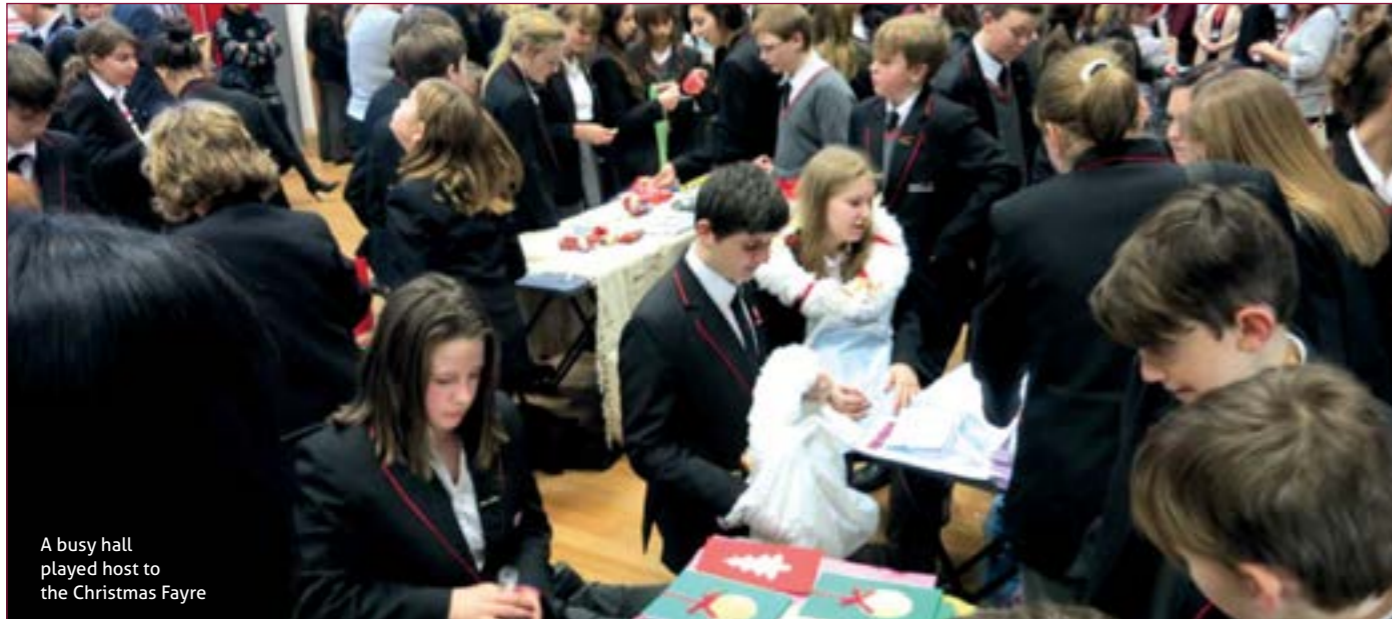
A busy hall played host to the Christmas Fayre

On the last Wednesday of term we held our first Christmas Fayre.