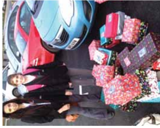
For more pictures, go to: www.makewav.es/story/424340/title/plgroupchristmasshoeboxappeal