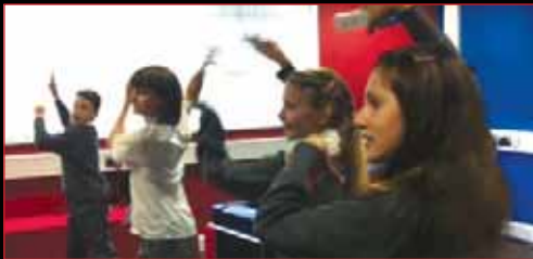
Children In Need

'Christmas Revue' full photographic report