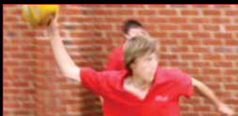
Inter College Dodgeball