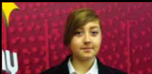
Yr 9 Winner