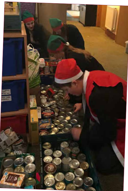
The Great Yarmouth Foodbank on Lowestoft Road and All Saints Church in Belton.

A record amount of food donations were given this year, with Create college winning the competition over which college could donate the most, and on Friday 15th the Union of Venture Students sorted the food into two equal amounts, packed it up into the academy mini bus and set off to deliver it to two local foodbanks.