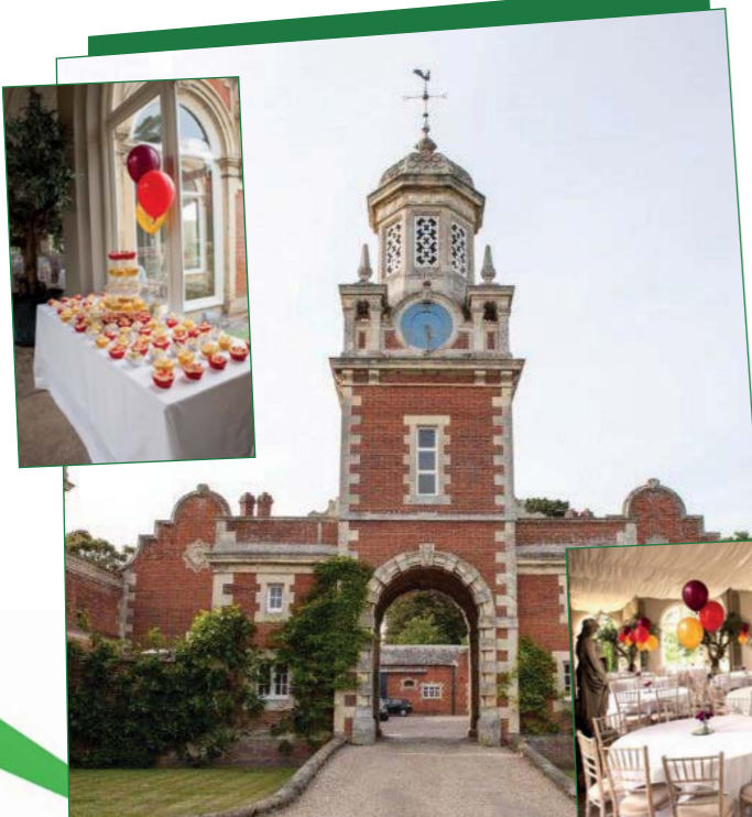
The prom this year was held at the impressive Somerleyton Hall and as the students pulled up outside, the sun shone. Around 100 parents and grandparents came to see the lovely dresses and suits and hundreds of photos were taken.