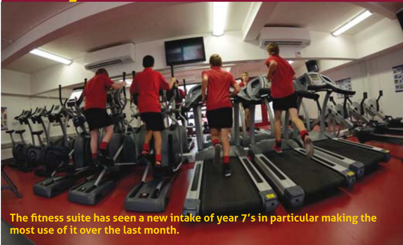
The fitness suite has seen a new intake of year 7's in particular making the most use of it over the last month.

The Year 9 boys Football Team have also got off to a great start to the season thrashing Acle 6-0.