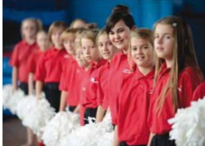
The cheerleading squad has also been practicing hard for their next big performance.